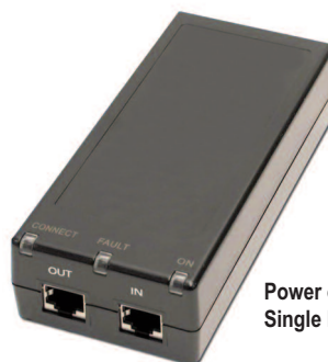
Power over Ethernet (PoE) Single Port Injector

A11-BW CONNECTIONS Programmer's Toolkit with ActiveX Controls: Write your own special software to control the digiBASE-E from LabView, Visual C++, or Visual Basic. List mode operations are available only using your own custom software.