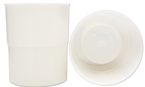
1 Liter Marinelli Beakers.

The matrix operations are based on Numerical Recipes. 3